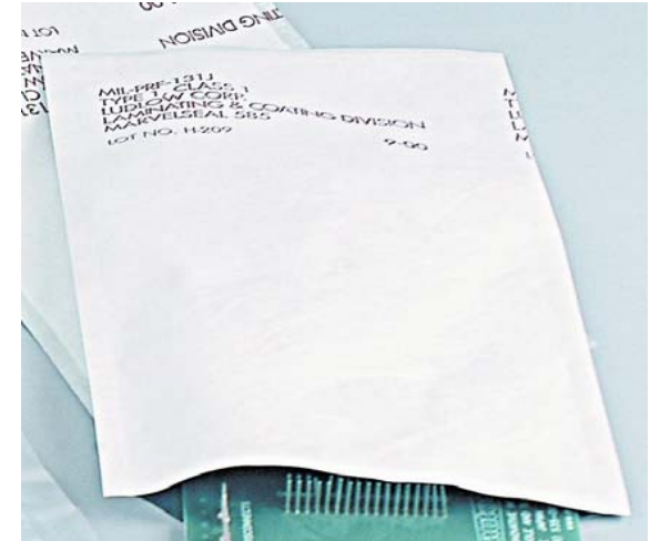
MPK-6000 Tyvek® Foil Polyethylene Moisture Barrier Bag