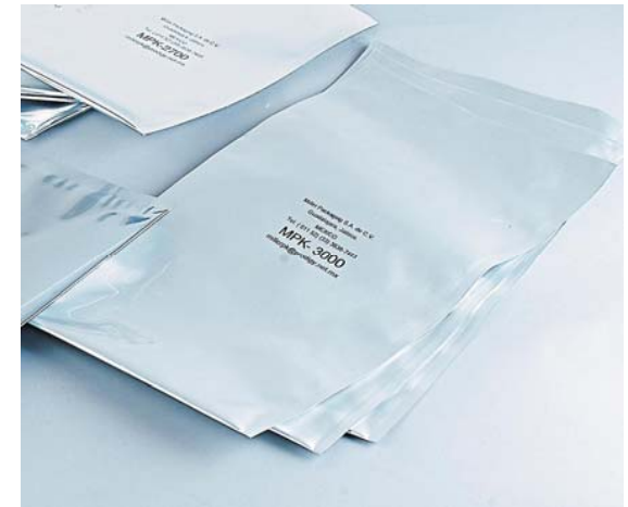
MPK-3000 Static Shield Moisture Barrier Bag