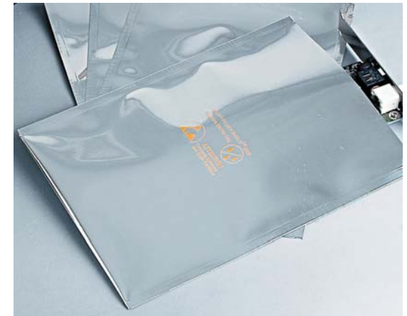
MPK-2700 High Puncture Resistant Moisture Barrier Bag