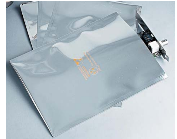
MPK-2001 3.6 mil Economical Moisture Barrier Bag