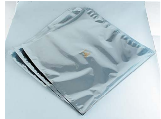
MPK-1000 Metal-in Static Shielding Bag Shown in open top configuration